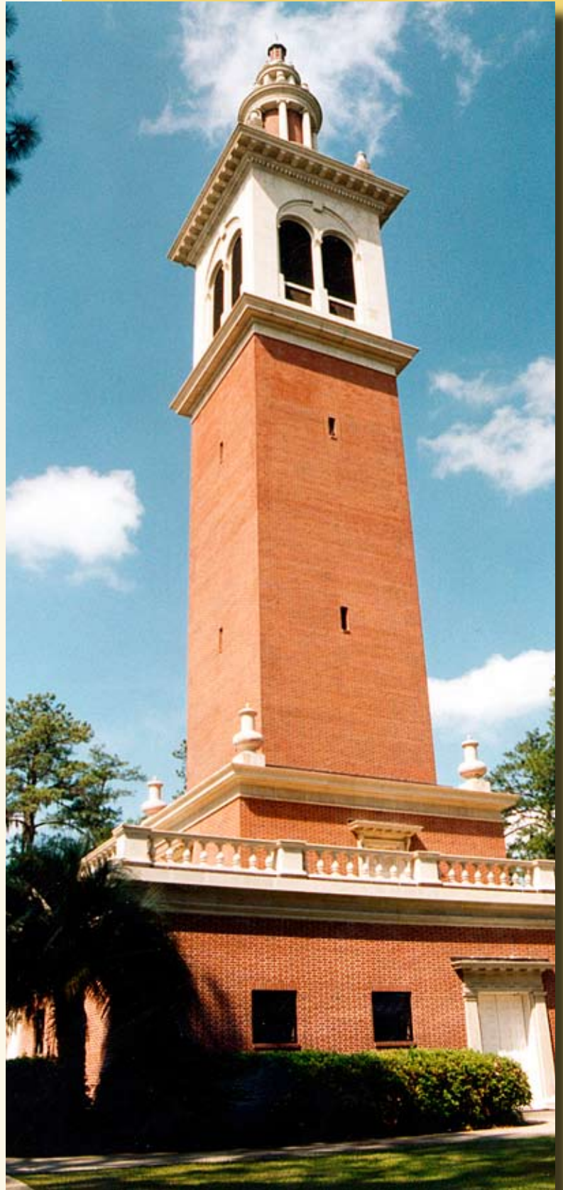
Bell Tower at Stephen Foster Folk Culture Center State Park

Historic Telford Hotel and Restaurant 16521 River Street White Springs, FL 32096 Phone: (386) 397-2000