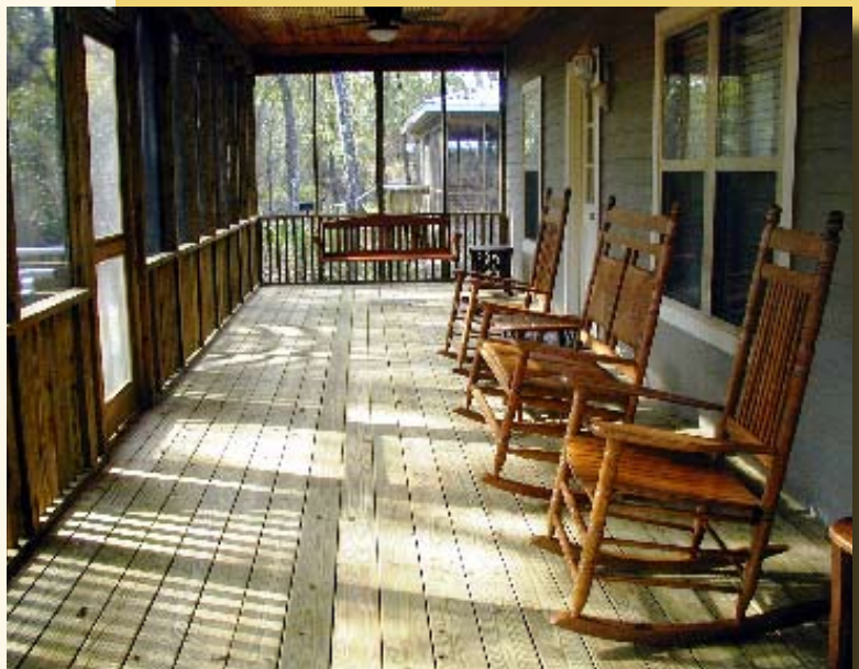
Cabin Front Porch at Stephen Foster Folk Culture Center State Park

Old Town Campground PO Box 522 Old Town, FL 32680 Phone: (386) 542-9500